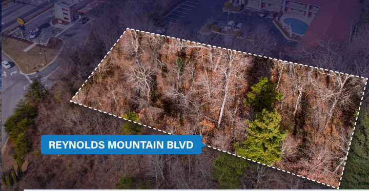
REYNOLDS MOUNTAIN BLVD